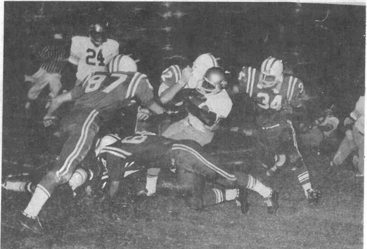
A hapless Poly back discovered the hard way why the Lakewood defense allowed only 29 points during the League season

* Coast League Games — Overall Record: 7-1-1